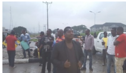
Tension as Ugborodo protesters set born fire around Chevron facility