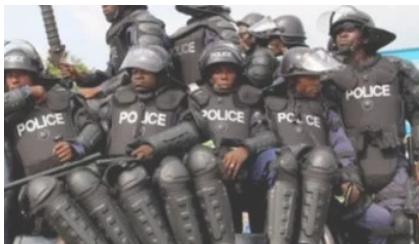
Police uncover 5 masterminds of of Ugborodo mayhem

The UCMC member stated, “So, the propaganda that we are not on ground is just to distract the committee in desperation to make us back down on the fight for justice, sanity, peace and tranquility in Ode-Ugborodo, where you have all the criminal elements. We are going to flush them out. None of them can be more powerful than government, which has declared them wanted.”