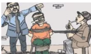
Kidnappers of Lagos monarch want N20m May 24, 2017 In "Crime Guard"

"Then we took an oath of secrecy over his death and burial at the village shrine. The consequence of breaking the oath is death."