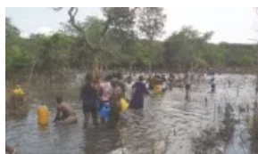
Four drown, hundreds displaced as Yoruba, Egun clash in Lagos November 10, 2016 In "News"