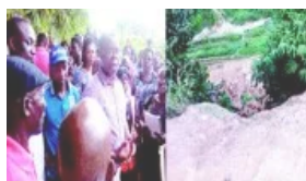
Erosion splits Cross River community into 3 parts November 29, 2016

Erosion menace: World Bank rescues 5 C-River communities IKOT AWATIN—TWO years back, the fear of erosion washing away residents, their homes and property was a recurring decimal in the lives of inhabitants of five communities October 10, 2016