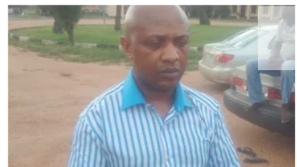
How notorious kidnapper, Evans was caught like a chicken