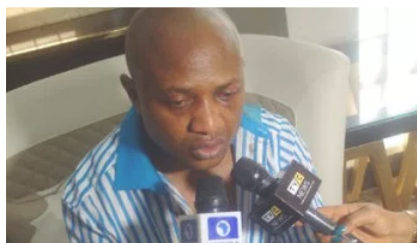
Why I chose to collect ransom in dollars – Notorious kidnapper Evans