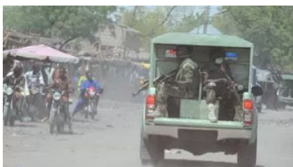
One dead as soldier shoots at protesting

" The General Officer Commanding, appeals to law abiding citizens to remain calm and go about their daily lawful activities, while assuring that 1 Division remains committed to security in its Area of Responsibility in conjunction with other security agencies".