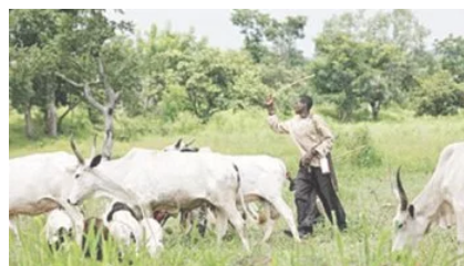
Herdsmen attacks, another Boko Haram