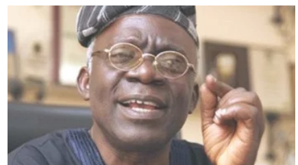
Falana petitions Osinbajo over