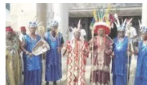
Appeal court ends 233-year old rule by Amobi family of Ogidi May 24, 2017 In "News"