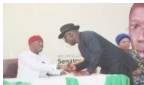
My Administration Spends N1 Billion Monthly On Pensions-- Okowa May 24, 2017 In "News"