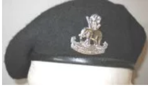
3 suicide bombers killed in another foiled attack in Borno May 24, 2017 In "News"

“He was at those places to evacuate about 3,682 IDPs from Banki town to Pulka; we are also making arrangements to fix the Government Secondary School, Bama, for it to contain nearly 78,000 IDPs that have been literary kicked out of Cameroon.”