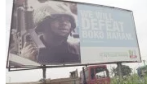
Boko Haram beheads four IDPs May 21, 2017 In "News"