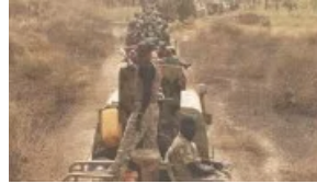
Boko Haram: Troops kill 9 terrorists, rescue 998 persons May 20, 2017 In "News"