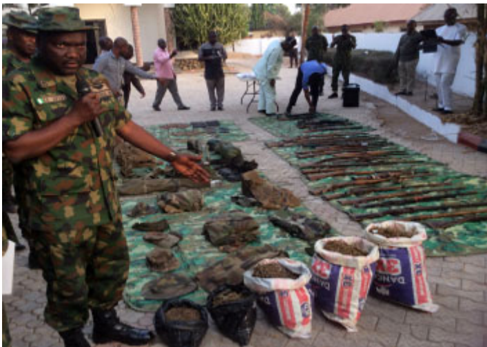
Brigadier General Apeere displaying the recovered items.

“Consequently, the troops conducted cordon-and-search operations to apprehend the youth militia that committed the act and also recover the soldiers rifles and ammunition they carted away.