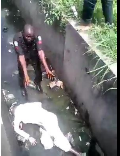
Policeman brutalizes old man to death in Lagos

Vanguard gathered that the incident, which occurred last Wednesday, started to generate controversy at the police command, after a video on social media showed the lifeless body of the aged man in drainage and a police officer trying to remove the corpse.