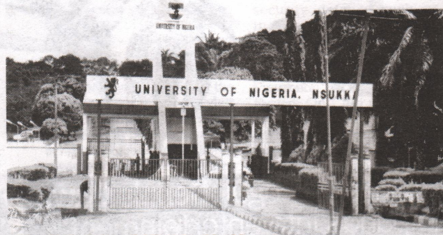
•The University of Nigeria, Nsukka