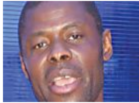
TB Joshua will not die but will suffer