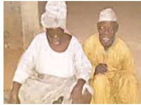
Man, 80, marries for the first time in Lagos