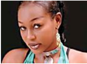
The big boobs boom