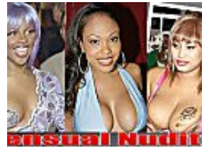
Sensual Nudity an emerging trend in fashion threatening dignity