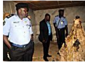
Police uncover underground cell, shrine in Ibadan