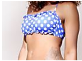
I have sex three to four times everyday