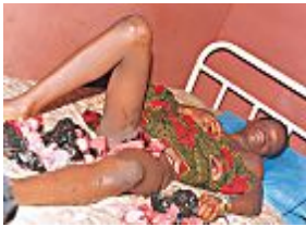
Rapists on rampage: Shocking stories of how minors have become endangered (2)