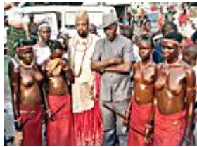
DELSU dons to Christians: Stop demonizing Urhobo culture