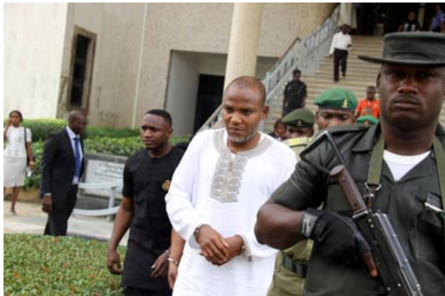
Detained leader of Indigenous People of Biafra, IPOB, Nnamdi Kanu in court, yesterday.

Civil society organizations in Abia State under the auspices of Abia Human Rights Agenda yesterday condemned what it described as the killing of defenceless protesters in Aba.