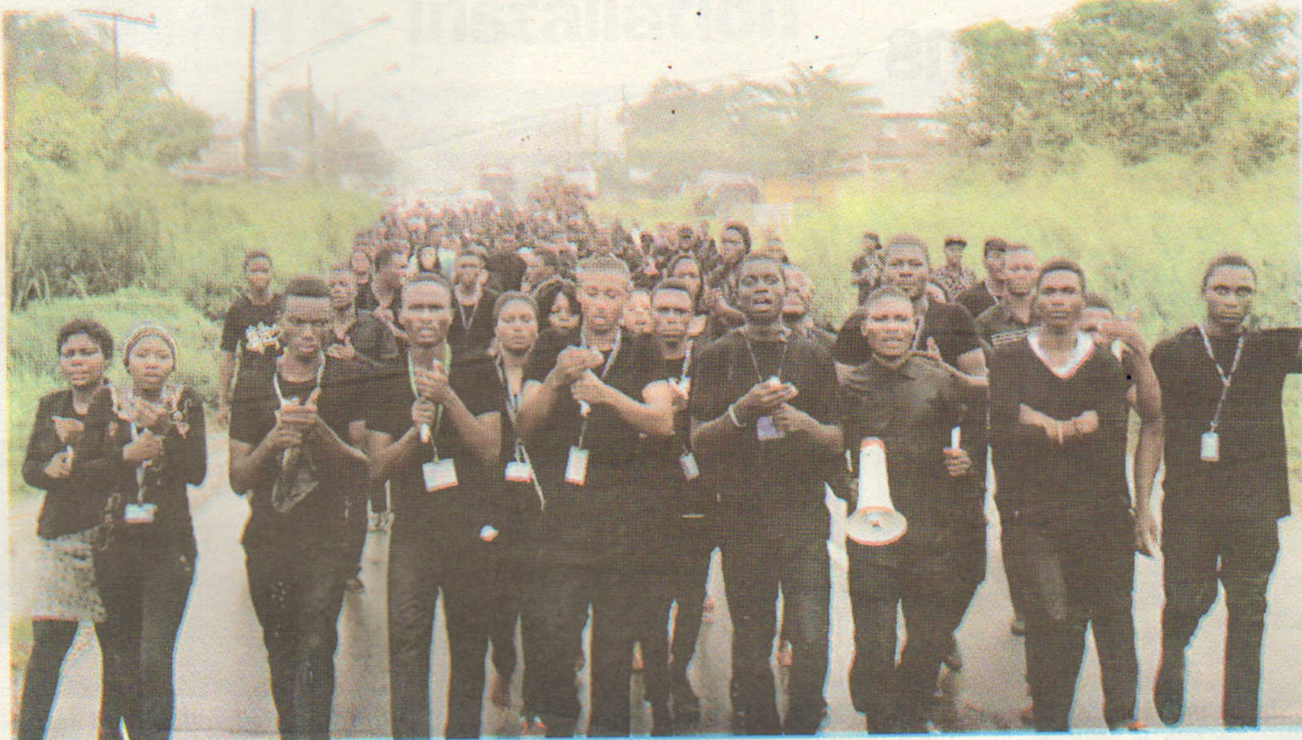
• OOU students during their protest over the death of their colleagues