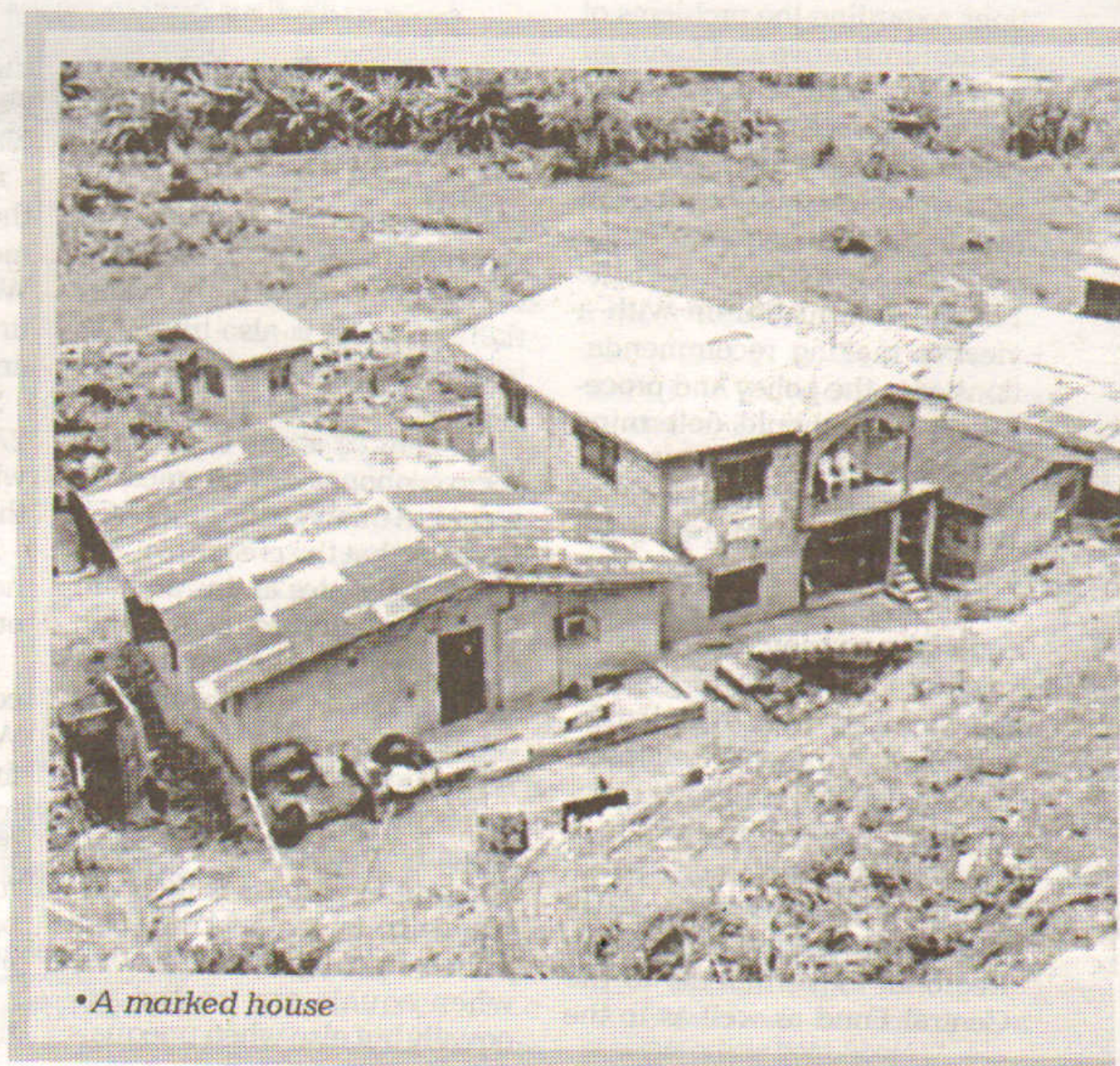
•A marked house