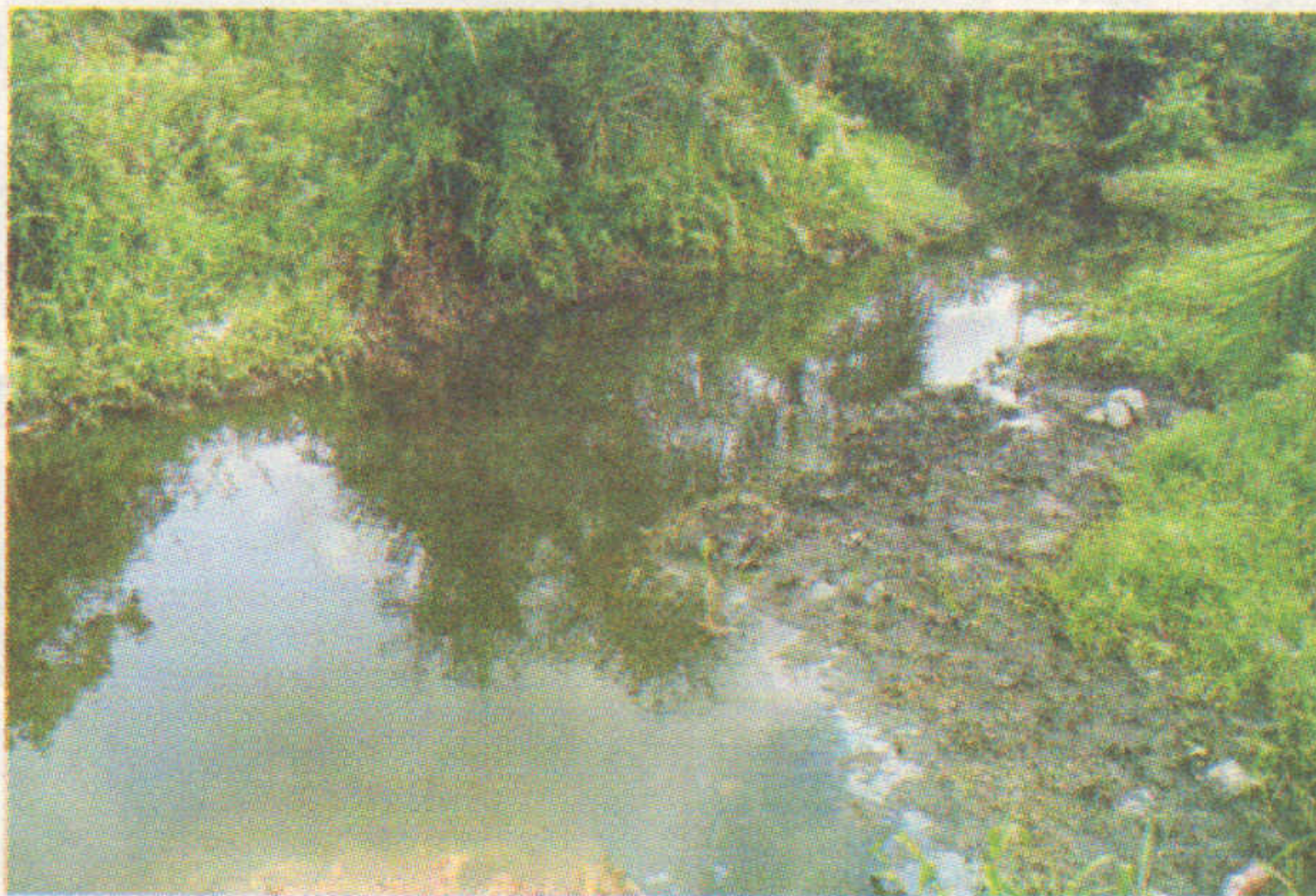
• The route through which pipeline vandals come into Victory estate to siphon fuel.

However Police sources at Area E Command Festac, said the raid was part of measures put in place to checkmate activities of pipeline vandals, describing claims that policemen were aiding the vandals as untrue.