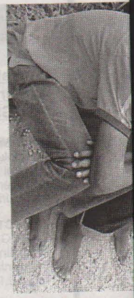
• The Suspects