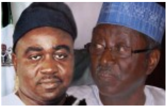
Northern Governors’ Forum meeting is dead – Gov Suswam