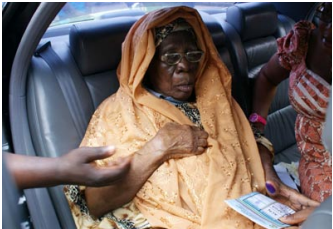
Tinubu’s mother, Abibatu Mogaji is dead