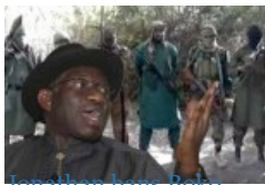
Jonathan bans Boko Haram, Ansaru

President Jonathan reassured Nigerians and foreigners in the country that the Nigerian Government will continue to do all that is required to ensure the safety of lives and property, including continued collaboration with local and international partners and stakeholders to check the menace of terrorism.