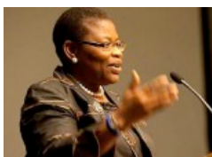
Ezekwesili to Jonathan: Stop presiding over contract award meetings