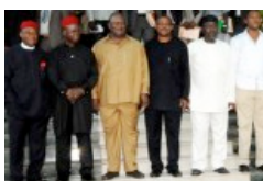
2015: Igbo 'll deliver S-East to PDP – Orji