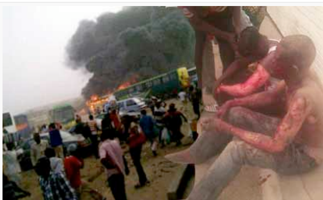
KANO BOMBING—Victims of the Kano suicide bombing and some of the affected buses yesterday as smoke billowed from the bus park.