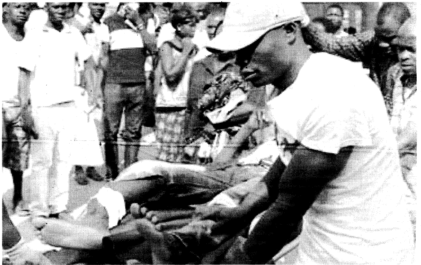
A victim of the Maddala bombings.