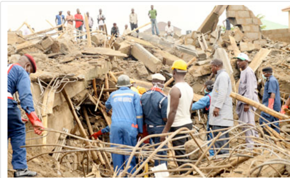
NEMA and NSCDC officials looking for victims from the rubble of the collapsed building in Kubwa, Abuja.

Tijani explained that many of the occupants quickly ran for their lives as soon as they heard the cracking of the building before it eventually collapsed.