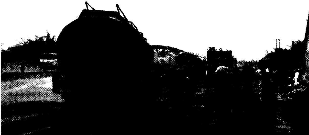
Rescue at the scene of explosion.