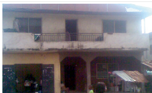
Scene of incident, 3, Lambe Street, Ago-Okota, Lagos