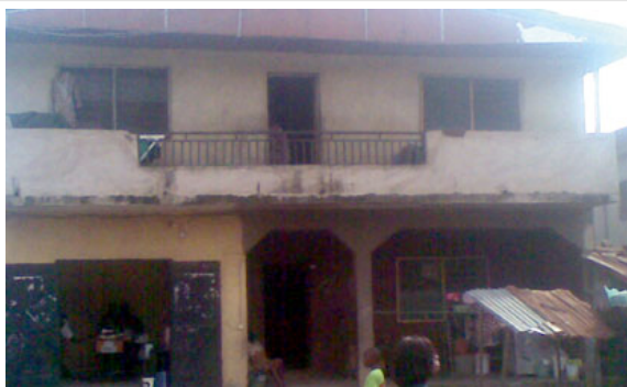
Scene of incident, 3, Lambe Street, Ago-Okota, Lagos