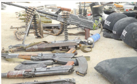
Arms and ammunition recovered by Borno State Police Command.

JTF members, however, engaged them in a shoot out and succeeded in killing three of them.