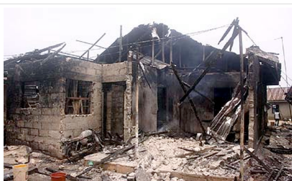
One of the affected houses.