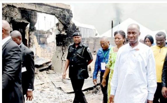
Gov Amaechi of Rivers State and his aides during a visit to the scene of the accident.

Another source said local emergency respondents and aggrieved residents on ground had to vent their anger by throwing stones at the fire fighters for coming late. They said their coming was no longer useful because several persons had died from the raging fire.