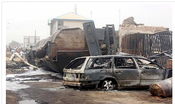
The Port Harcourt inferno

They said the tanker suddenly went up in flames when it fell, adding that about 15 houses were razed subsequently. The driver of the tanker was said to have survived but reportedly suffered serious burns. He escaped when he saw the damage from the accident.