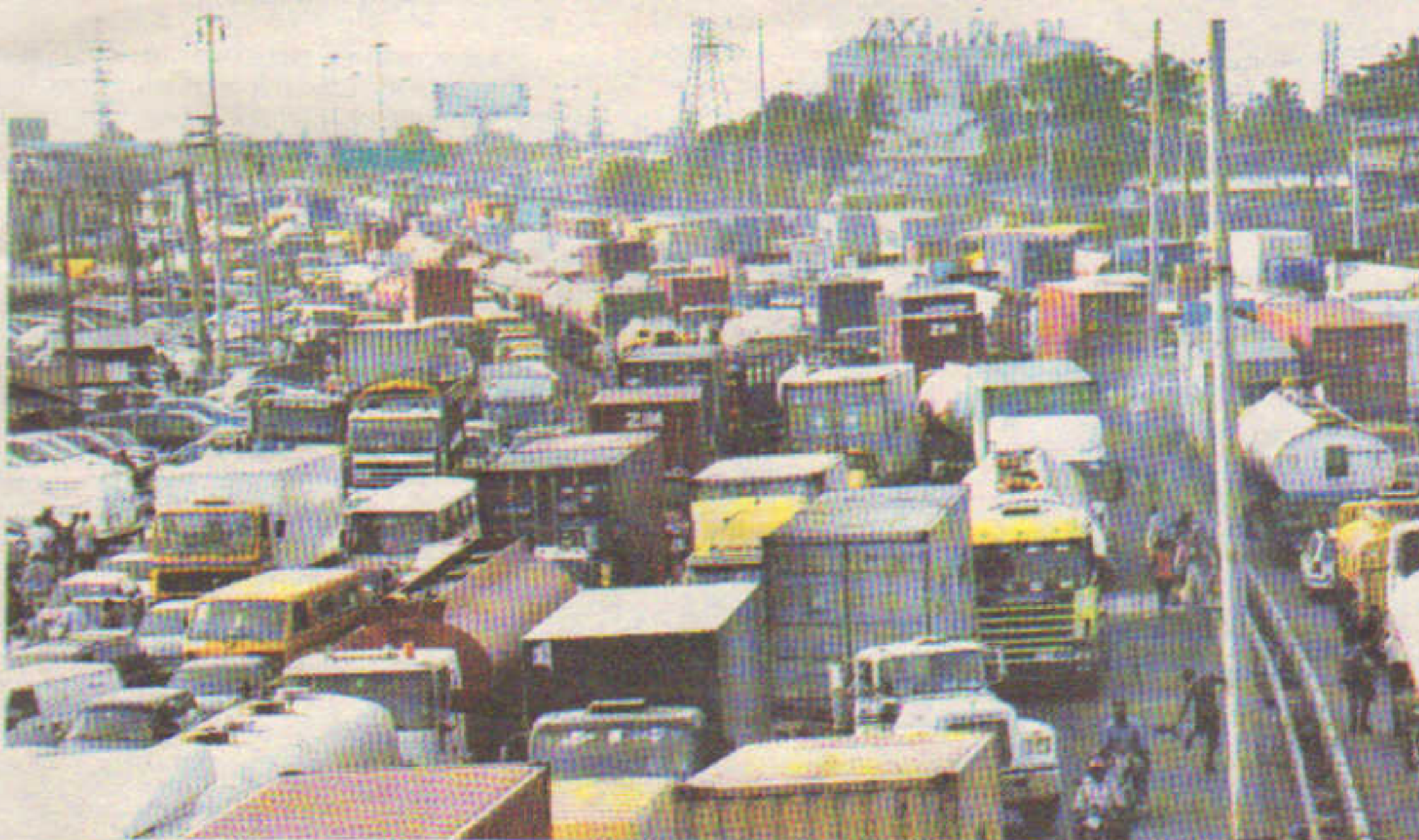
NIGERIA'S ECONOMIC ARTERY BLOCKED AGAIN —Oshodi/Apapa Expressway, yesterday.

Nigerian ship arrested in Ghana over crude oil theft — P. 6