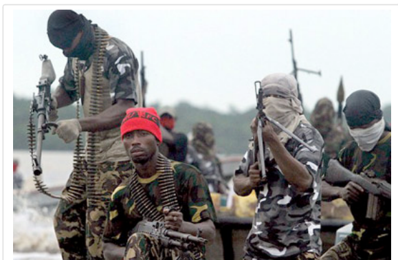
Militants in action

Eyewitnesses said the police and military personnel were ambushed by the yet to be identified gunmen suspected to be pirates in separate attacks.