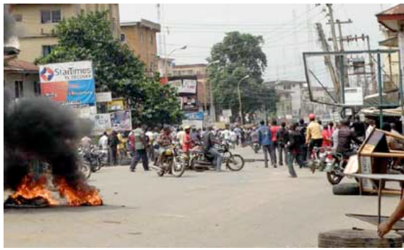
...the angry protesters

The situation however took a dangerous turn when angry mob comprising of drivers and commercial motorcyclist popularly known as 'okada riders' went on rampage with the corpse of the driver, for reprisal attack on Hausas people in Onitsha.