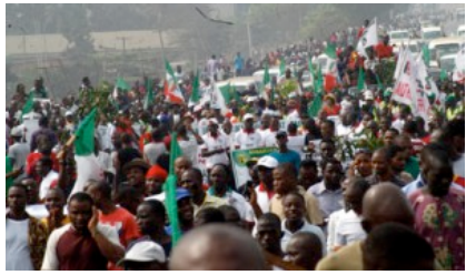
Protesters along Ikorodu Road in Lagos, yesterday.

Leaders of LASCO coordinated the protest from five zones in Lagos; namely NLC secretariat, Yaba; TUC Secretariat, Idi-Roko; Office of the Agric and Allied Workers Union in Iyana-Ipaja; the Textile union secretariat on Acme Road, Ogba and the Lagos State University Campus in Ojo.