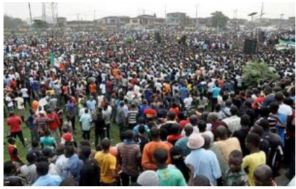
Subsidy protesters at Gani Fawehinmi park at Ojota, Lagos during the Labour/Civil society protest, yesterday.

According to an eye witness, the DPO was driving in a pick-up patrol van with plate number RRS 101 LA and on getting to Yaya Abatan Crescent in Ifako Ijaye Local Government Area, the road was reportedly blocked with tyres by youths who were playing football. It was not too clear what led to the sad incident, but a source at the command headquarters said the DPO claimed one of the players attempted to disarm him, necessitating his firing some shots.