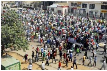
Protesters in Abuja, yesterday.

The police deployed Armoured Personnel Carrier complimented by a detachment of soldiers, Airforce personnel, and anti riot policemen to ensure that the protest which lasted two hours did not go out of hand.