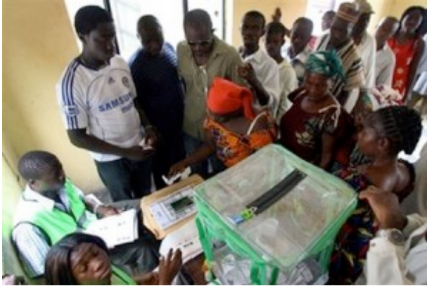
Nigerians voting on an election day

Less than 48 hours or two days to the first leg (N/A poll) of the all-important April general elections in Nigeria, it may be correct to say that over 130 Nigerian citizens have been killed outside the law and over 400 injured in pre-election related violence since July 2010. Again, July 2010 was the peak of the pre-election activities in Nigeria as a result of the INEC's earlier schedule to hold elections in December 2010 and January 2011 respectively.