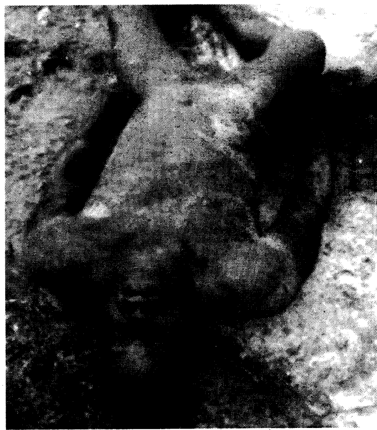
* His dead body

"It is in the light of the foregoing that we are calling on you to employ your good offices to unravel and bring to book the officers and men of