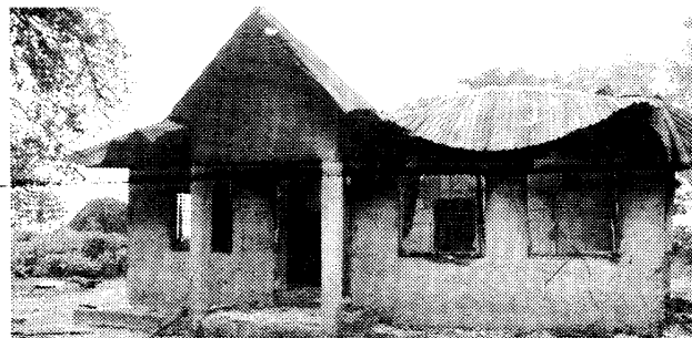
One of the 60 houses razed down in the mayhem.