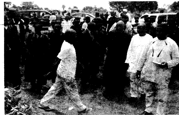
From right, Benue State Governor, Mr. Gabriel Suswam, Commissioner of Information and Orientation (in white), Mr. Conrad Wergba, Senator Barnabas Gemade (in caftan), representing Benue North East Senatorial District and others assessing the extent of destruction at Ugba, in the Logo Local Government Area of Benue State.