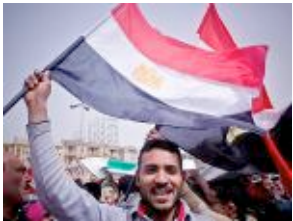
Will the Arab Uprising Spread to Sub Saharan Africa?