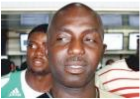
Govt Takes Steps to Stem the Spread of Cholera in...