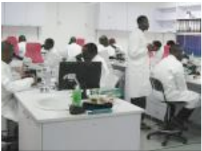
State Govt Condemns Doctors' Strike in Nigeria