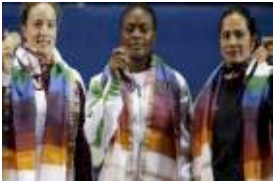
Tenth All Africa Games - Nigeria Begins Medals Haul