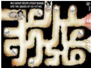
Gaddafi Family Has Reportedly Fled Libya