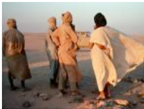
What Is Happening in Morocco?