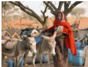
Sudan: U.S. Urges Ceasefire in South Kordofan