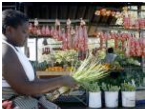
Zimbabwe's President Mugabe Courts Foreign Investors