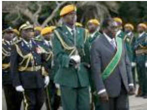
Zimbabwe Military Chief Vows to Keep Mugabe in Power