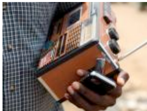
Global Technology Firms Gear Up for Push into Africa

Créez un compte ou connectez-vous pour voir ce que vos amis recommandent.