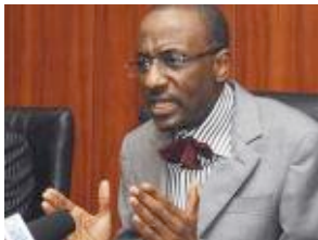
Nigerian Banks to Implement Deposit and Withdrawal Limits