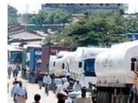
African Leaders Aim for Free Trade From Cape to Cairo