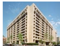
Continental Body Wants an African as IMF Chief