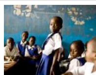
'Much More to Do', Says Liberian President Johnson Sirleaf