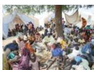
Fighting Surges as South Sudan Independence Looms