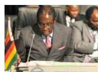
Southern African Presidents Push Zimbabwe Leaders