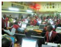
Africa: Where to Invest in the Next Five Years