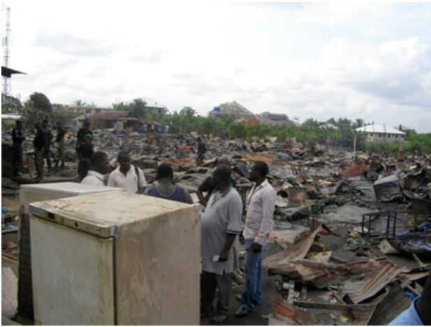
Charred remain of burnt structures in Yenagoa inferno

The tragic inferno occurred in the densely populated slum Sunday night between 7.30 and 8pm