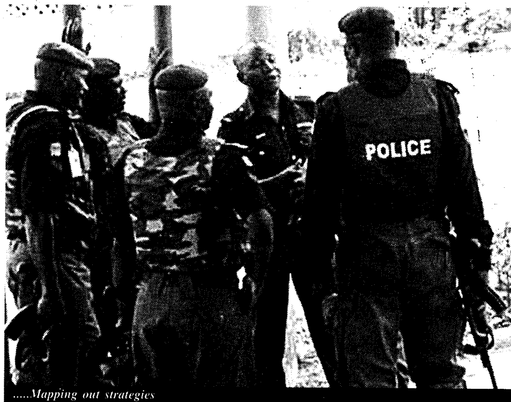
.....Mapping out strategies