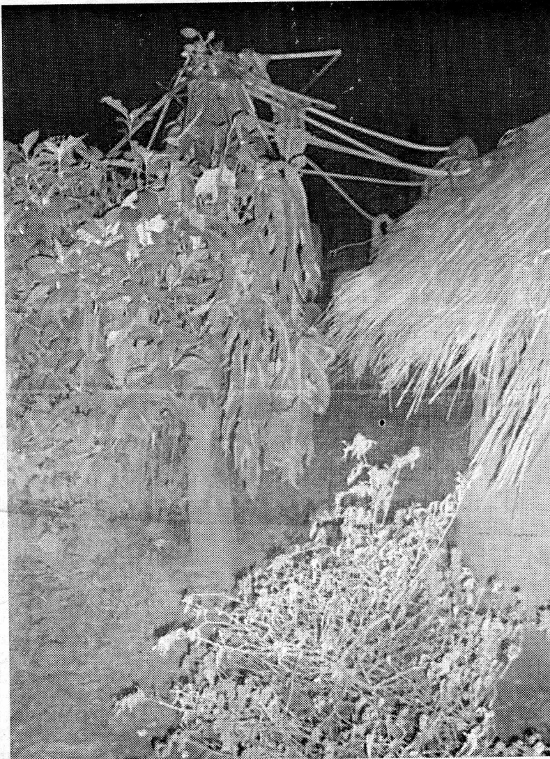
*Tree uprooted by thunder

The bereaved woman stressed that in the midst of the confusion,