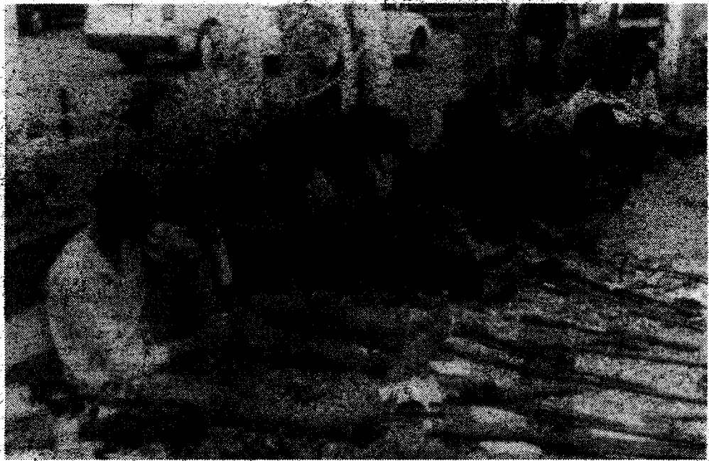
Suspected robbers arrested by the Police.

It is believed that the attack on the police DO may have likely facilitated the easy escape of the robbers who shouted stern warnings