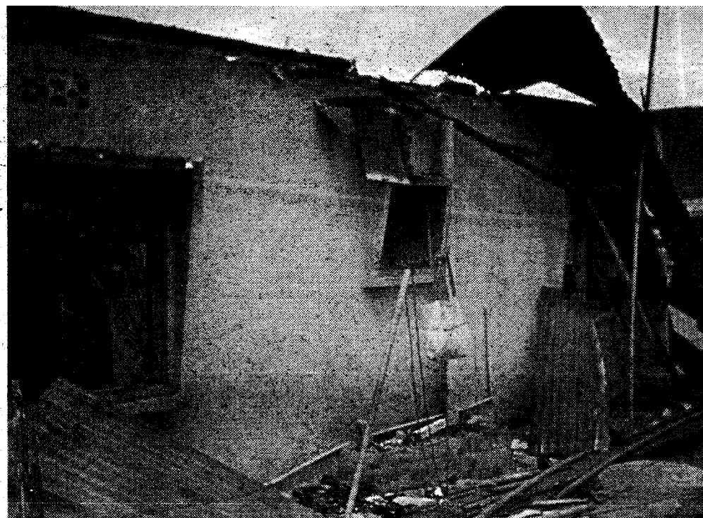
●Burnt-out remains of the Uzamere home

The cause of the fire still remains a mystery because it was shocking to know from the fire fighters who came to put off the fire that as they were trying to do that, the fire was escalating the more. Everything in the building