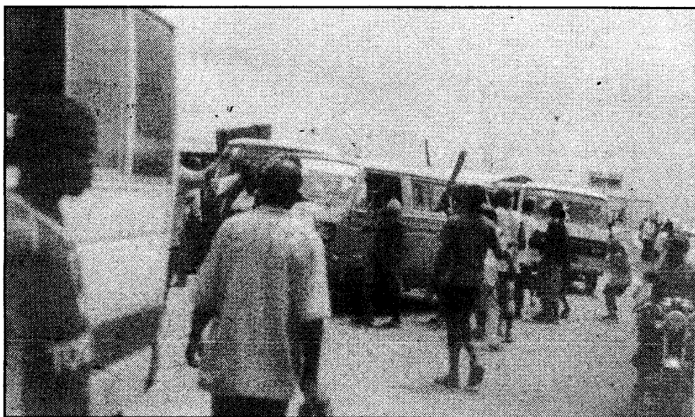
A recent scene of public disturbance.

The skirmishes continued unabated for almost four days running resulting in the disruption of social and business activities in the area. The high point of the almost one week carnage was the attack on the Palace by those perceived to be opposing the overlordship of Fatai Olumegbon of Ajah who of course, is at the centre of the crisis. However, the police came in immediately and arrested no fewer than 17 persons suspected to be brains