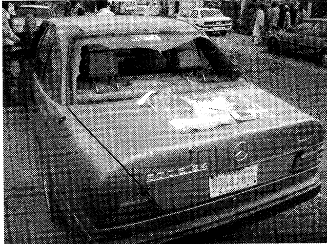
•Car of ANPP chairman in Abeokuta South vandalized

ensure adequate protection of lives and property in Ogun State, the Federal Government has directed the beefing up of security in and around the state capital with the deployment of soldiers to augment the efforts of the Nigerian Police with immediate effect.