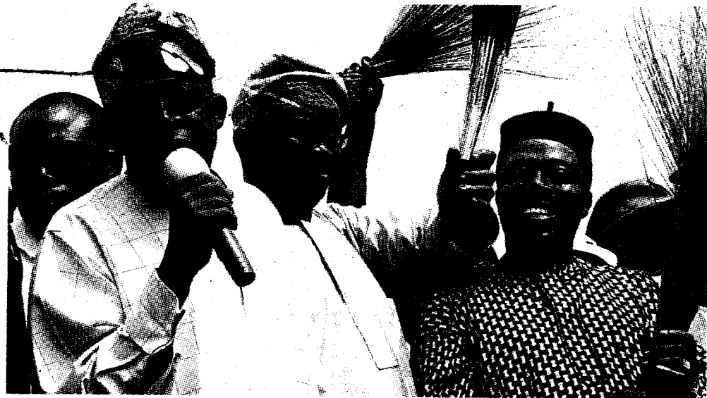
AC RALLY: From left, Gov Bola Tinubu, Mr Babatunde Fashola, AC guber candidate for Lagos; and Rep. Ganiyu Solomon at a 'sweeping rally' in Lagos, yesterday. ● More on Page 35.

PORT-HARCOURT— PORT Harcourt, the Rivers State capital, was yesterday practically turned into a theatre of war after some people suspected to be supporters of a militant, Soboma George, went on a shooting spree throwing residents into Continues on Page 15