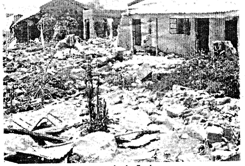
●Remains of houses swept away by the flood