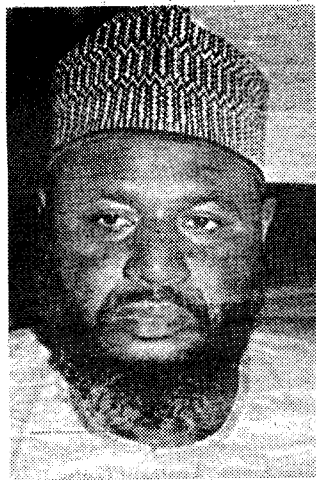
●Governor Ahmad Sani

●Untold story of disaster in which 100 people died