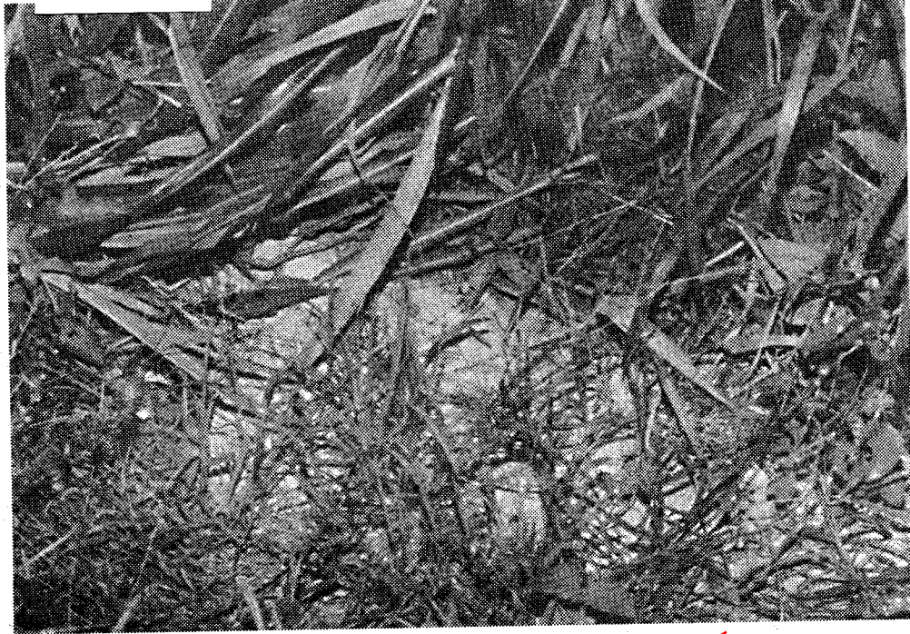
●The bush where the body of the Fulani woman was found