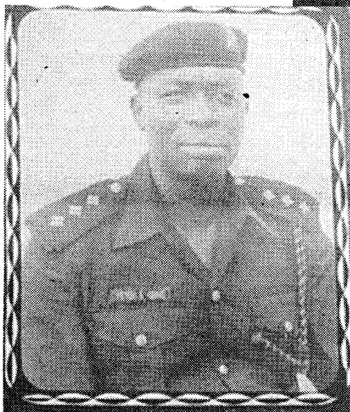
•Photograph of a police officer in one of the buildings that was spared by the invading policemen at Afiesere