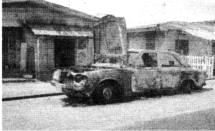
•One of the burnt cars at Afiesere