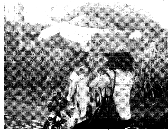
•A female villager fleeing Afiesere with her belongings

A We were reliably informed that the September 14 carnage could have been averted if due care was taken to dislodge the boys who were operating the Afiesere motor-park along Warri-Ughelli road. The armed boys are