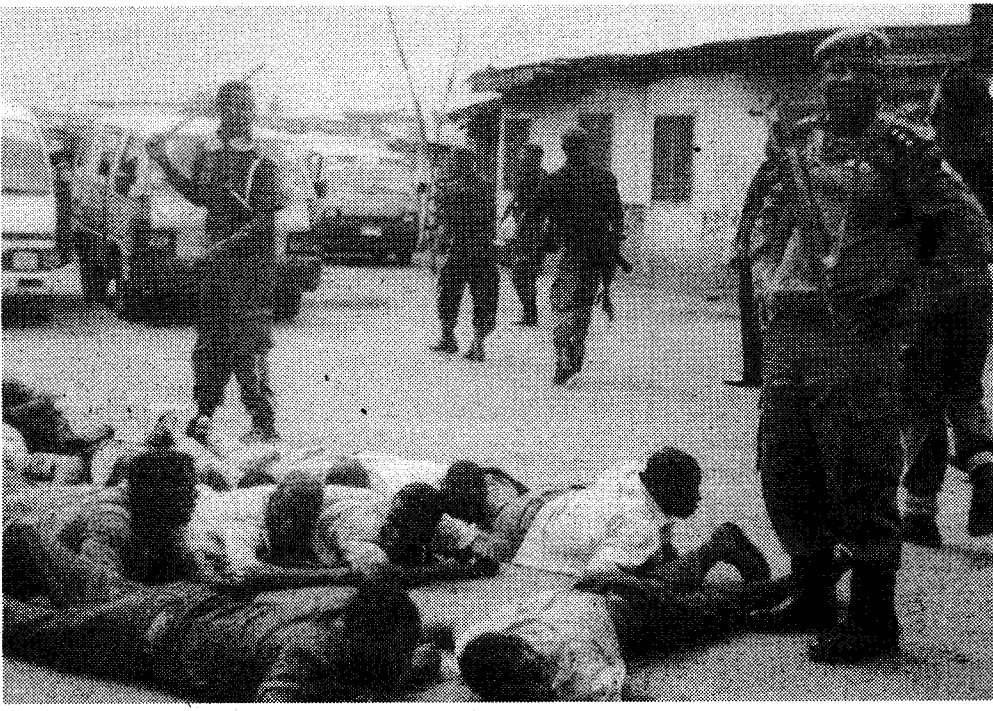
Policemen with some arrested criminals.