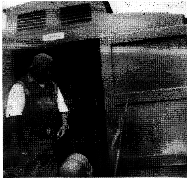
Battle-ready mobile policeman.

For Mrs Aliogu Ekene, "My place is very close to the popular Alaba International market along the Badagry Expressway. In the last few months, robbers have in-