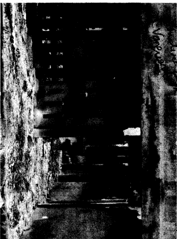
Onitsha: A burnt police station, and right, carcass of another Police vehicle

When will Onitsha and other cities in Anambra have long-lasting peace as opposed to curfew imposed on the troubled spots even if to temporarily stop the crisis from escalating?