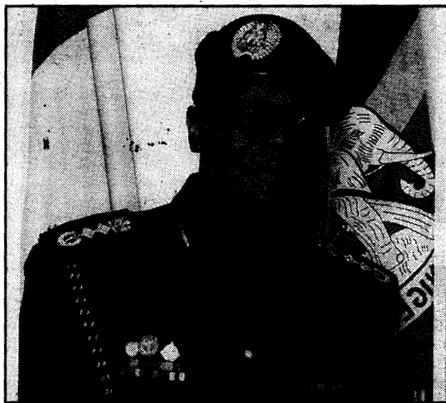
*Inspector-General of Police, Mr Sunday Ehindero

case as the police detectives quickly rounded them up just when they were all ready to take off and raid the company. In fact, one of the robbers confessed that he started the plan after he was laid off by the company and that he was going to do it as a revenge to the treatment he was given.