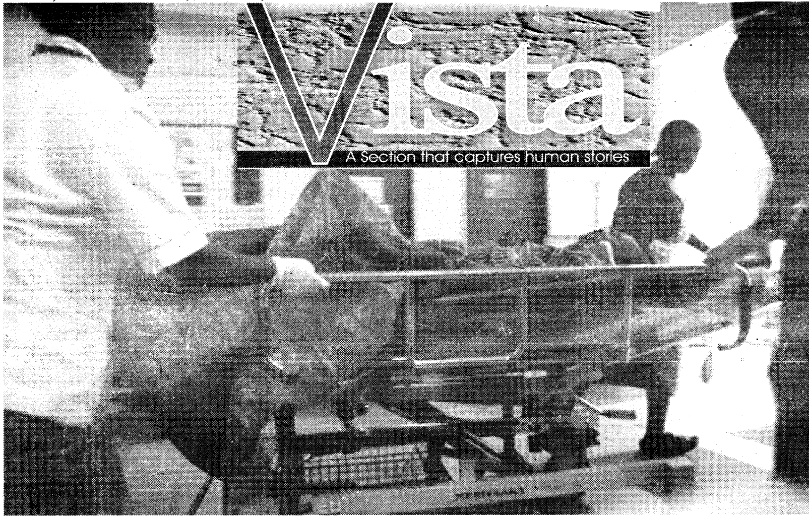
•National Hospital, Abuja medical team ...rescuing the airforce plane crash victims...last year